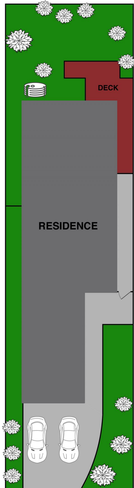
Siteplan (not to scale)