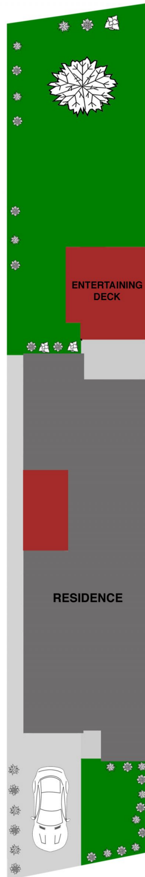
Siteplan (not to scale)