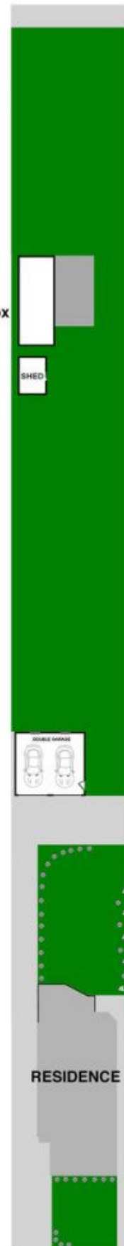
Siteplan (not to scale)

DEMOUNTABLE DWELLING 9.00m x 3.60m approx