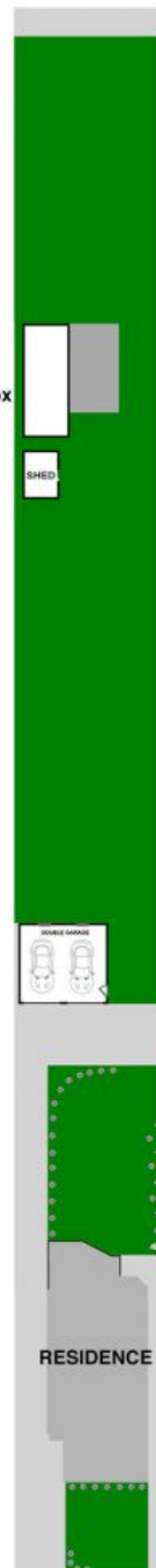
Siteplan (not to scale)

DEMOUNTABLE DWELLING 9.00m x 3.60m approx