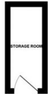
Storage Room 2.80m x 1.20m