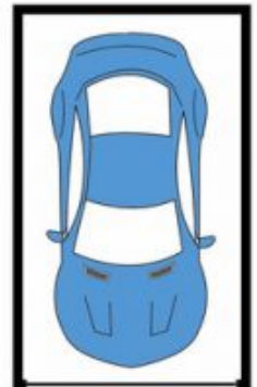
Lock Up Garage