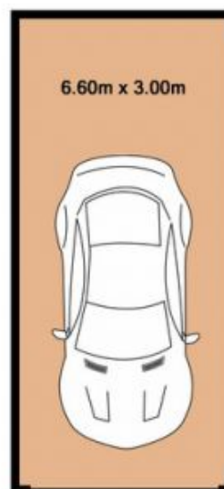
Lock Up Garage